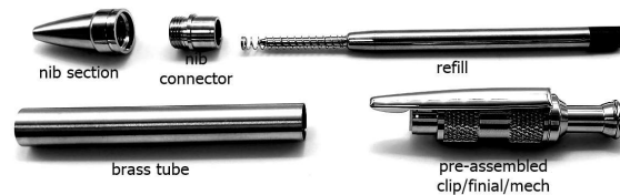
FORGE CL PEN KIT PARTS